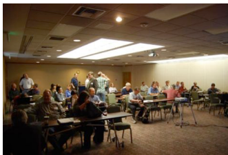
View of the audience at the UCR-Extension facility