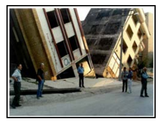
Adapazari, Turkey (1999 Kocaeli EQ)

Many design methods are based on insights gleaned from observations from past events. Field observations are particularly important in the discipline of geotechnical engineering, because it is difficult to replicate in the laboratory soil deposits built by nature over thousands of years. Much of the data generated by an extreme event is perishable and therefore must be collected within a few days of the occurrence of the event. Thus, engineers should be ready to investigate the next important extreme event.