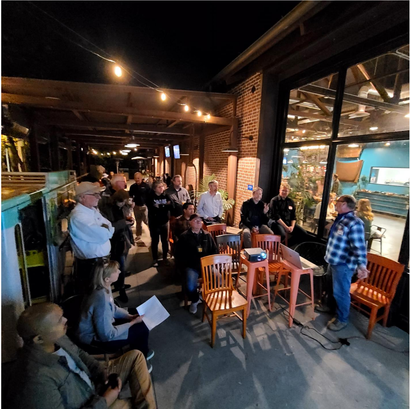
The first AEG-IE meeting was well attended with by local professors, students and geologists.