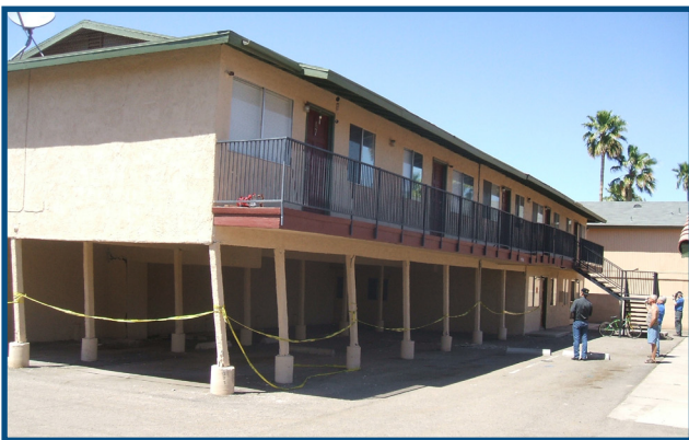
2010 El Mayor-Cuicapah earthquake.