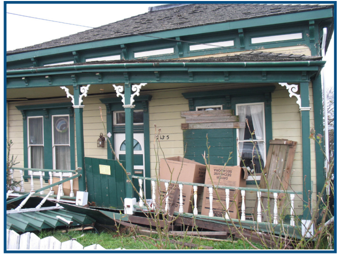
2010 Offshore Northern CA (Eureka) earthquake.

Visit the Clearinghouse website at www.eqclearinghouse/CA