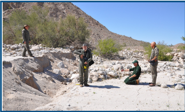
2010 El Mayor-Cuicapah earthquake.

A place to coordinate earthquake field investigations and share observations and knowledge among emergency responders and the engineering and scientific communities