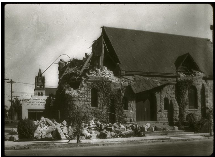
1925 Santa Barbara Earthquake