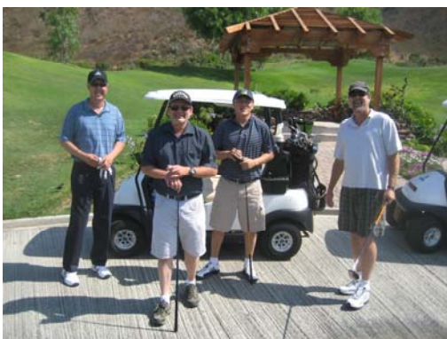
The Grover-Hollingsworth contingent