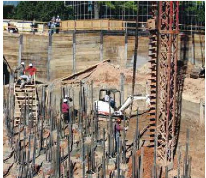
The Deep Foundations Institute Augered Cast-in-Place Pile Committee Presents Two Events