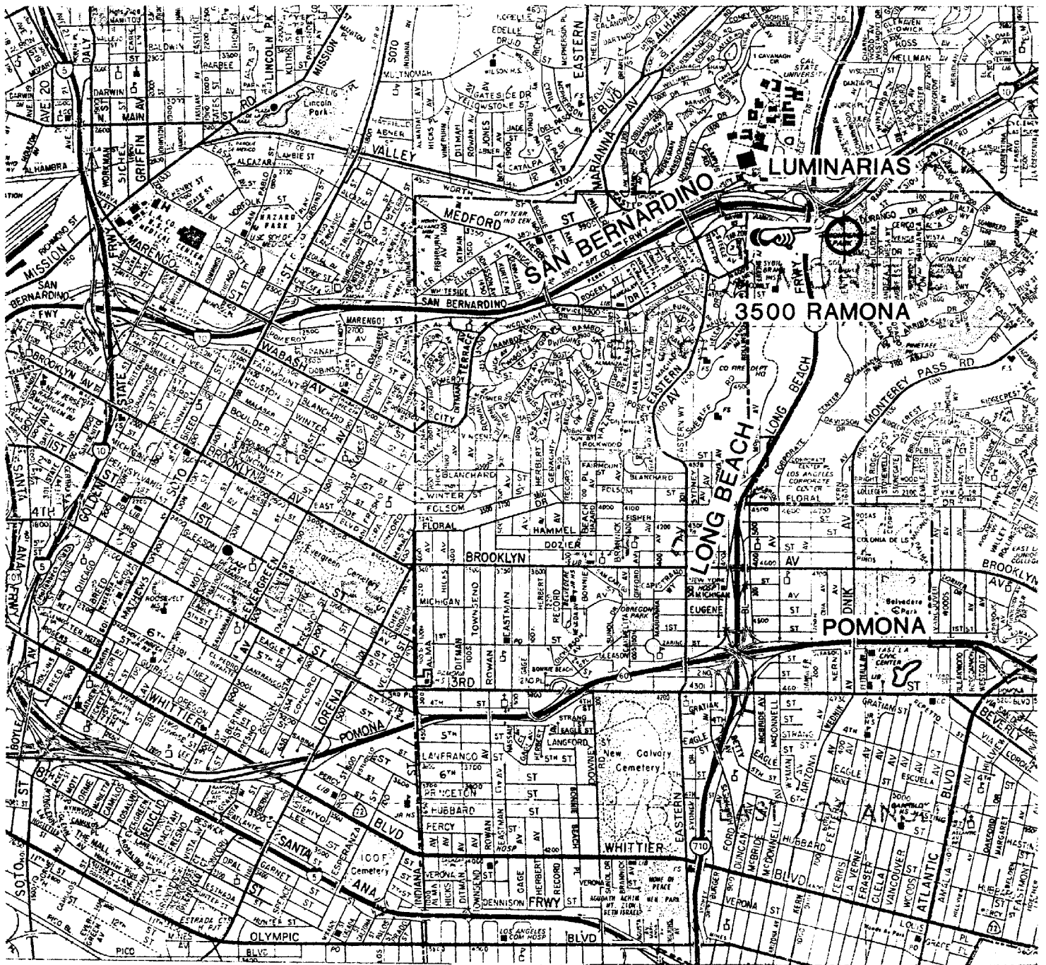
MAP TO LUMINARIA'S RESTAURANT--MONTEREY PARK